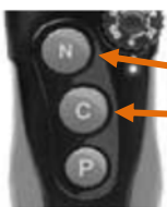
NICK button and CONSTANT button on the front of the transmitter.