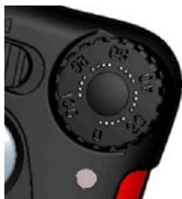
Intensity Selection Dial