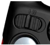
Selector switch Dog I / Dog II